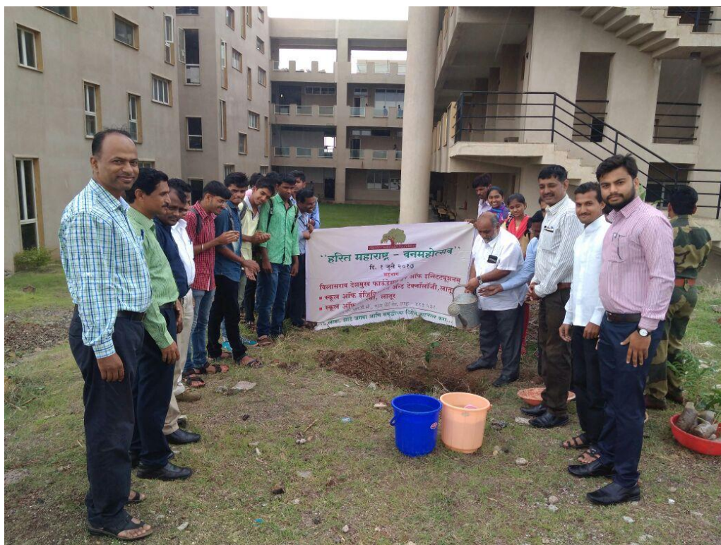
Photo 1-Tree Plantation