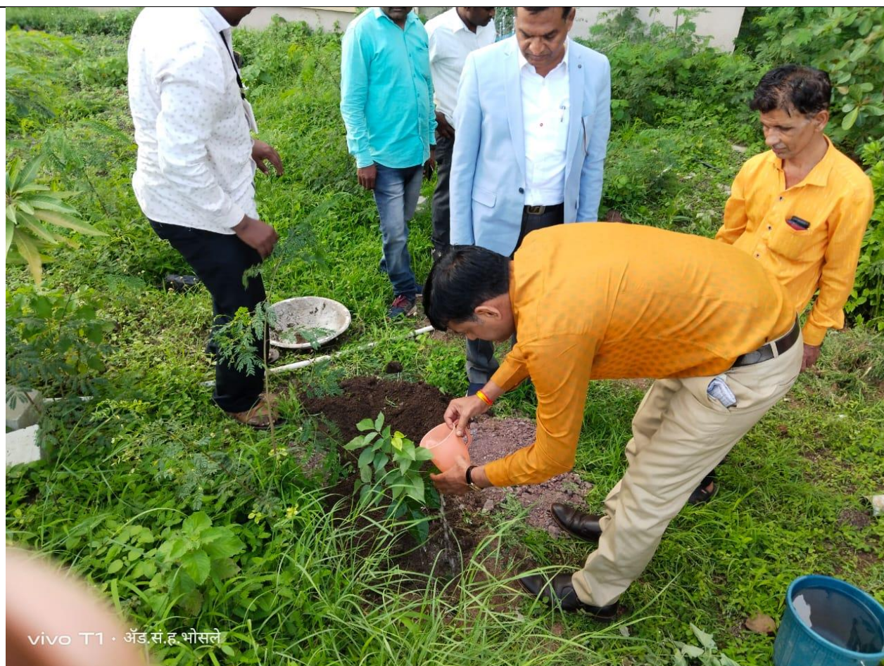
Photo 7 Tree Plantation