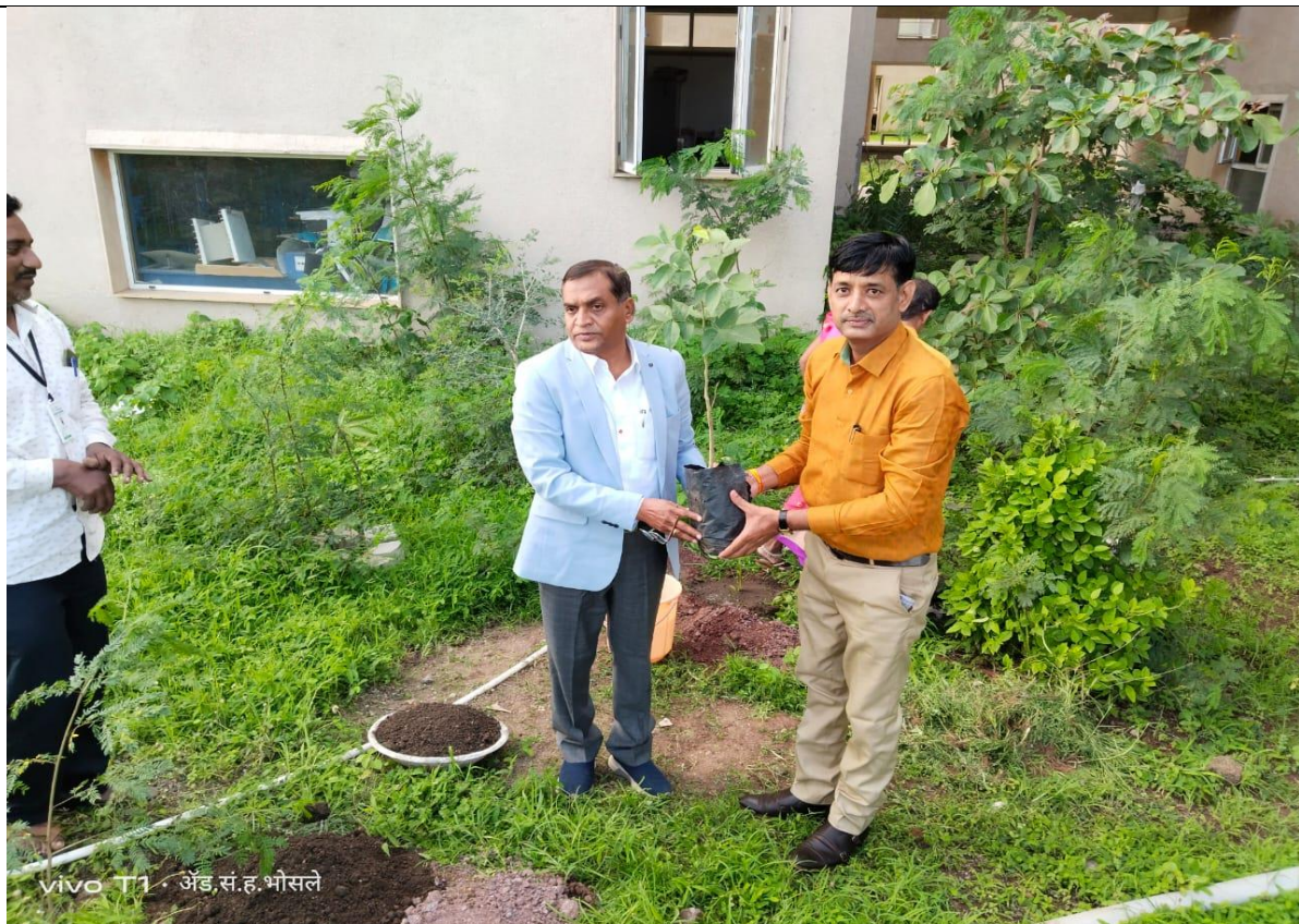
Photo 9 Tree Plantation