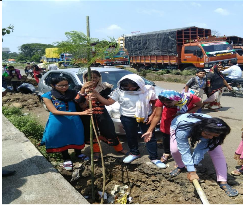
Photo 5-Tree Plantation