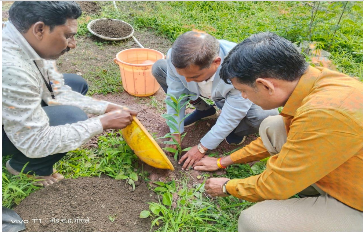
Photo 8 Tree Plantation