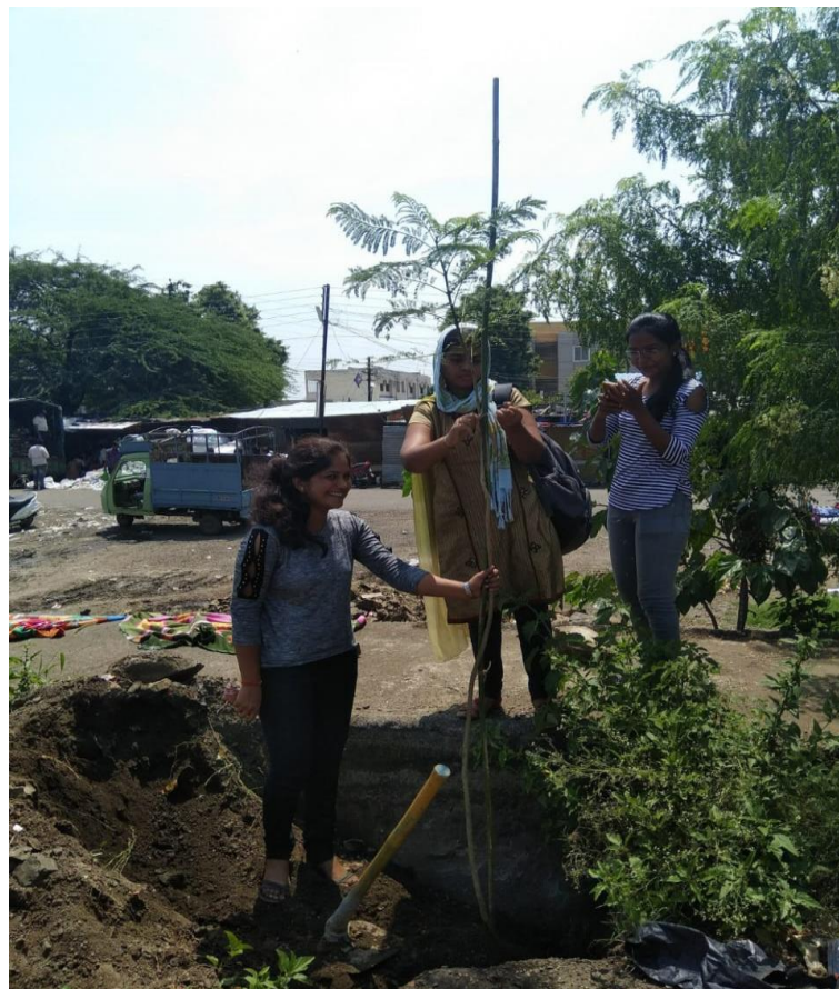
Photo 6-Tree Plantation