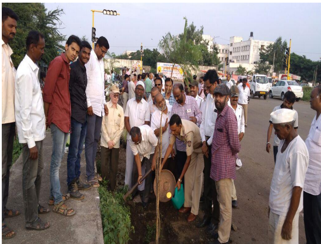
Photo 4-Tree Plantation